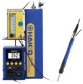
Setup with N 2 system

Check out the difference between nozzle assemblies A and B with the tip T50-D06.